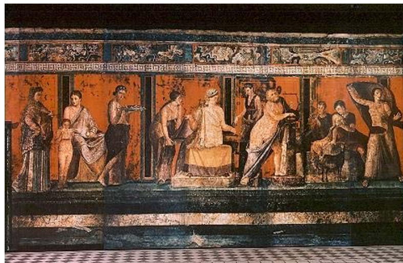
Picture 6. Fresco in the Villa of the Mysteries, Pompei

Hungarian-American designer and architect Marcel Breuer revolutionized contemporary chair design by creating the first chairs suitable for mass production. In 1925 he designed one of his most famous chairs, the Wassily armchair, made of chrome-plated steel tubing and canvas. Breuer studied and later taught at the Bauhaus school of design in Weimar, Germany, and his furniture designs reflect the Bauhaus principle of achieving a functionalist balance between technology, purpose, and aesthetics to yield simple, practical pieces different from traditional styles of furniture.