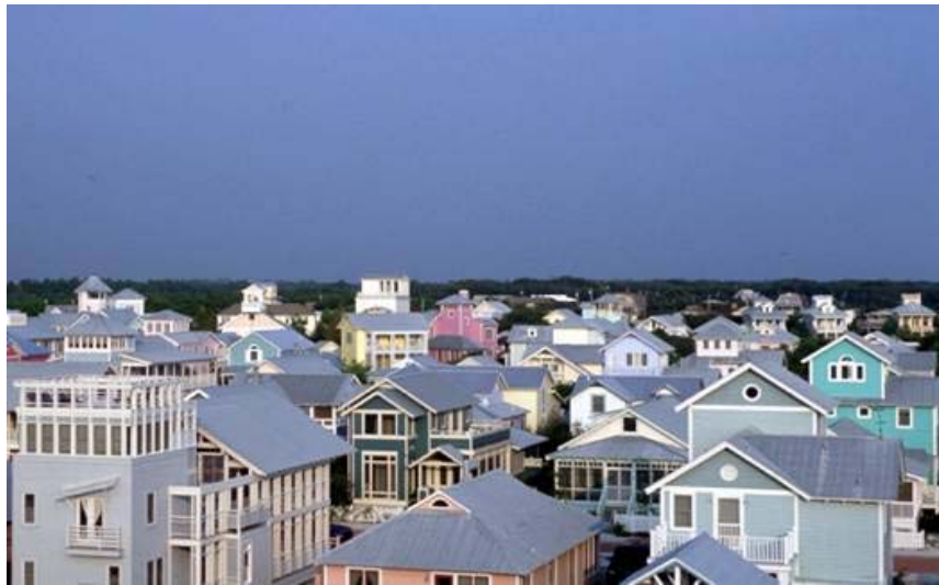
Picture 7. Seaside, Florida

Contemporary landscape architecture plays an important role in the large-scale organization of communities to balance their natural, cultivated, and constructed elements. The planned resort community of Seaside, located in Florida on the coast of the Gulf of Mexico, was designed as a neo-traditionalist town by architects Andres Duany and Elizabeth Plater-Zyberk. Founded in 1981, Seaside gave rise to a movement known as New Urbanism, which promotes public spaces and downplays the role of the automobile.