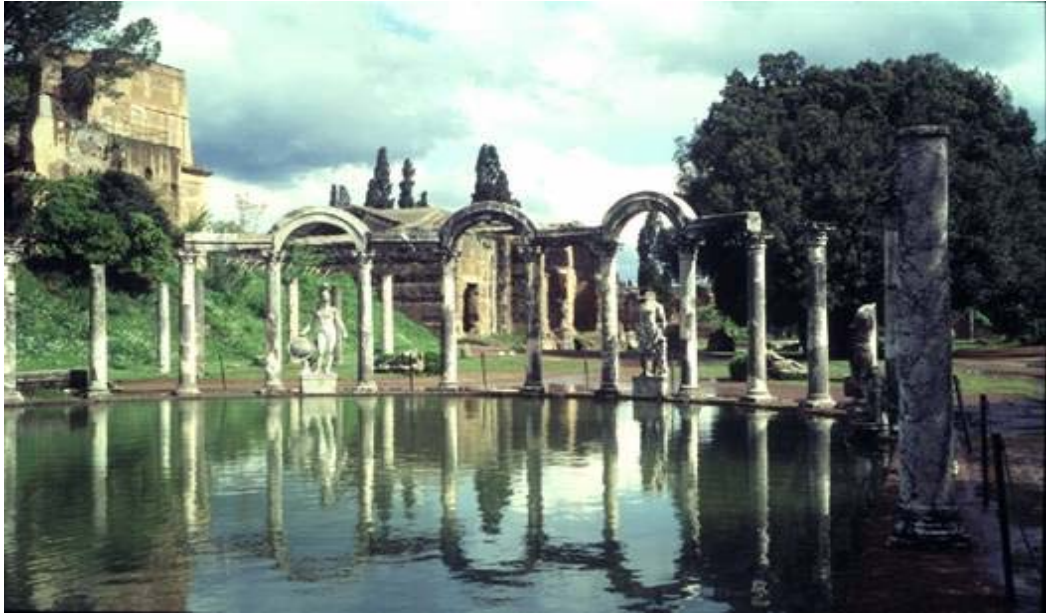
Picture 3. Canopus at Hadrian's Villa

The villa of Hadrian, at Tivoli, Italy (ad 118/34), was the largest Roman villa ever built. This view shows one end of the Canopus, named after the two-mile canal connecting Canopus and Alexandria in Greece. The Canopus consists of a series of pillars and arches interspersed with copies of Greek sculptures surrounding an elongated pool.