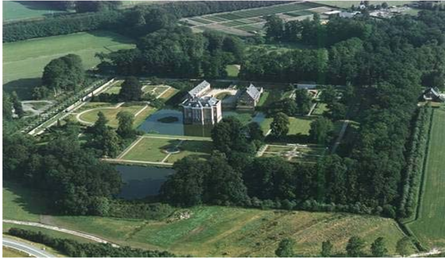
Picture 1. Grounds of Middachten Castle

Good landscape architecture combines various elements such as plants, buildings, and ponds or lakes in an aesthetically pleasing way. The landscaping of Middachten Castle, near De Steeg, Netherlands, meets this requirement. The grounds were made a reality about 1900, but they follow exactly the design first created about 1700, which was influenced by French landscape architecture of the late Baroque period.