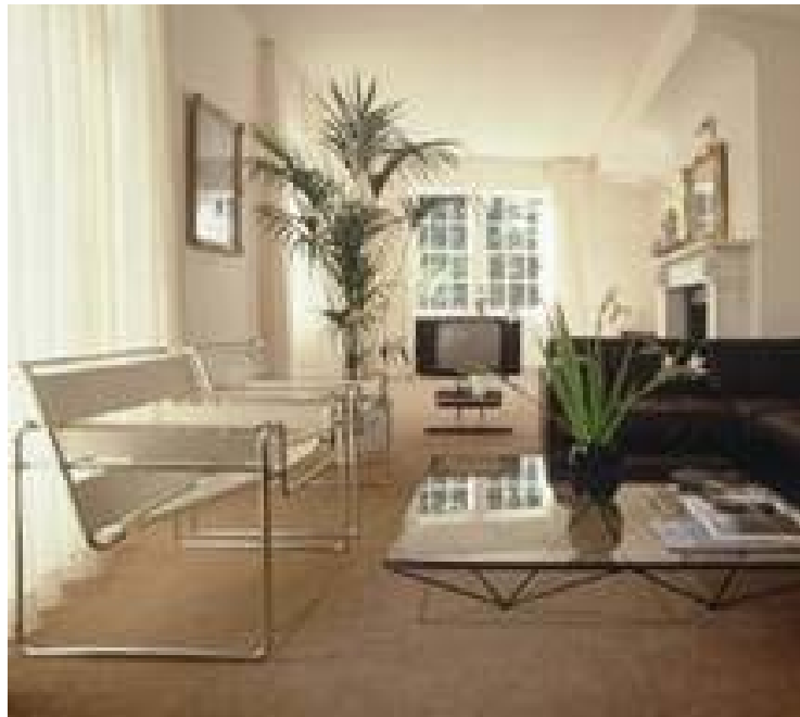
Picture 5. Wassily Chair

Hungarian-American designer and architect Marcel Breuer revolutionized contemporary chair design by creating the first chairs suitable for mass production. In 1925 he designed one of his most famous chairs, the Wassily armchair, made of chrome-plated steel tubing and canvas. Breuer studied and later taught at the Bauhaus school of design in Weimar, Germany, and his furniture designs reflect the Bauhaus principle of achieving a functionalist balance between technology, purpose, and aesthetics to yield simple, practical pieces different from traditional styles of furniture.