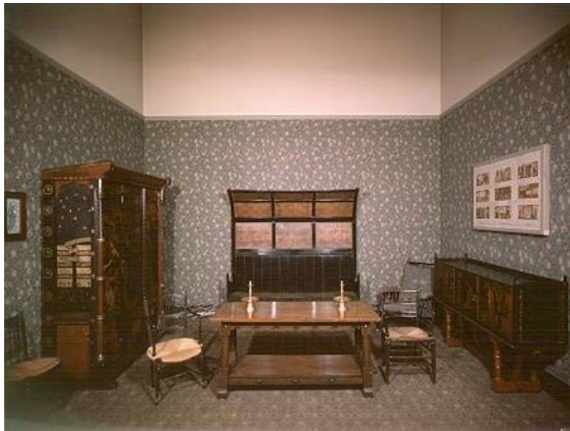
Picture 3. William Morris Interior

This interior was designed by British artist William Morris and his associates around 1860. The style is that of the Arts and Crafts movement, which was started by Morris in reaction to the decorative excess of the Victorian style and to the lifelessness of mass production. The furniture, textiles, and wallpaper are all hand-made. The cabinets on the right and left feature Pre-Raphaelite paintings; the Morris designs on the wallpaper and carpet are taken from medieval manuscripts.