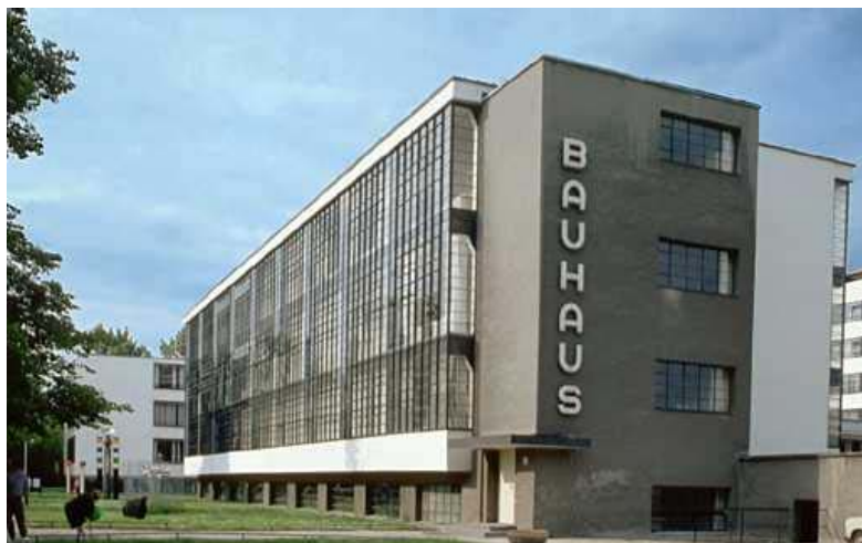
Picture 8. Bauhaus Building, Dessau, Germany

The high, decorated ceilings and painted walls of the 14th-century Palazzo Davanzati in Florence, Italy, were typical in the homes of wealthy people during the Renaissance.