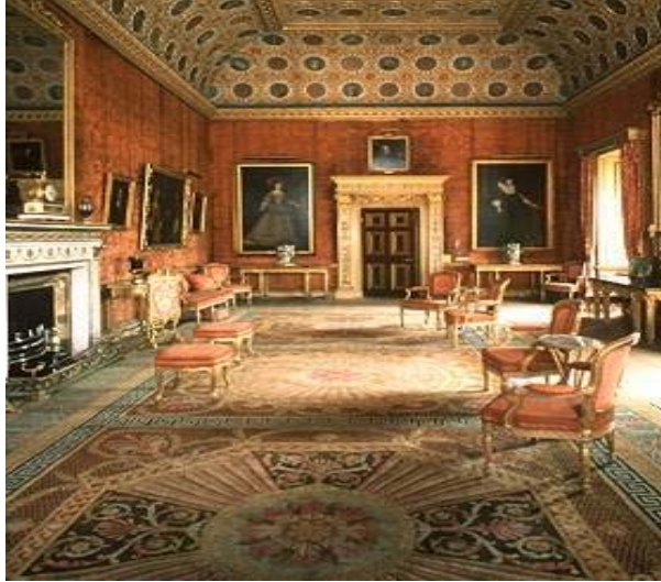
Picture 1. Red Drawing Room, Syon House, England

The Red Drawing Room is part of Syon House (Middlesex, England), designed and built by Scottish-born architect Robert Adam from 1762 to 1769. Classical Roman interiors were an influence on Adam's work, but he also used ideas from his French contemporaries, who he felt understood how interior space and daily life were interconnected.