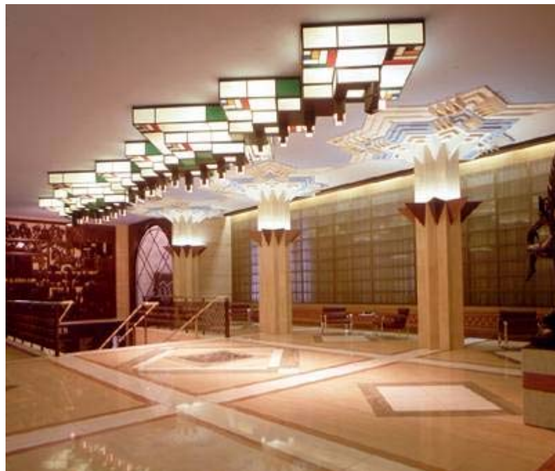
Picture 4. Art Deco Interior at Unilever House

This interior was designed by British artist William Morris and his associates around 1860. The style is that of the Arts and Crafts movement, which was started by Morris in reaction to the decorative excess of the Victorian style and to the lifelessness of mass production. The furniture, textiles, and wallpaper are all hand-made. The cabinets on the right and left feature Pre-Raphaelite paintings; the Morris designs on the wallpaper and carpet are taken from medieval manuscripts.