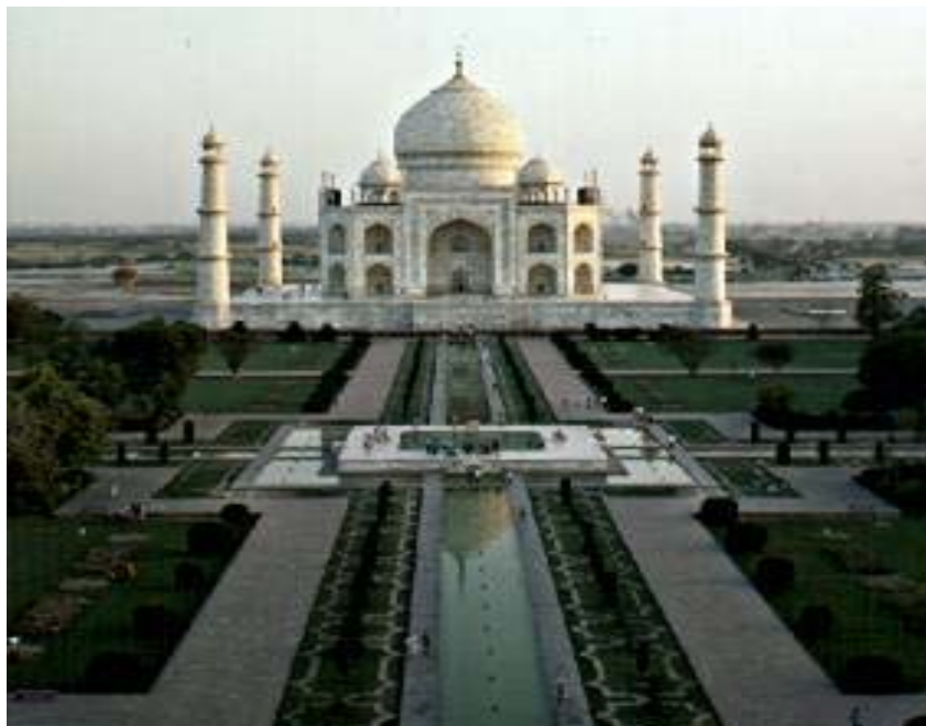
Picture 8. Taj Mahal and Surrounding Gardens

Contemporary landscape architecture plays an important role in the large-scale organization of communities to balance their natural, cultivated, and constructed elements. The planned resort community of Seaside, located in Florida on the coast of the Gulf of Mexico, was designed as a neo-traditionalist town by architects Andres Duany and Elizabeth Plater-Zyberk. Founded in 1981, Seaside gave rise to a movement known as New Urbanism, which promotes public spaces and downplays the role of the automobile.