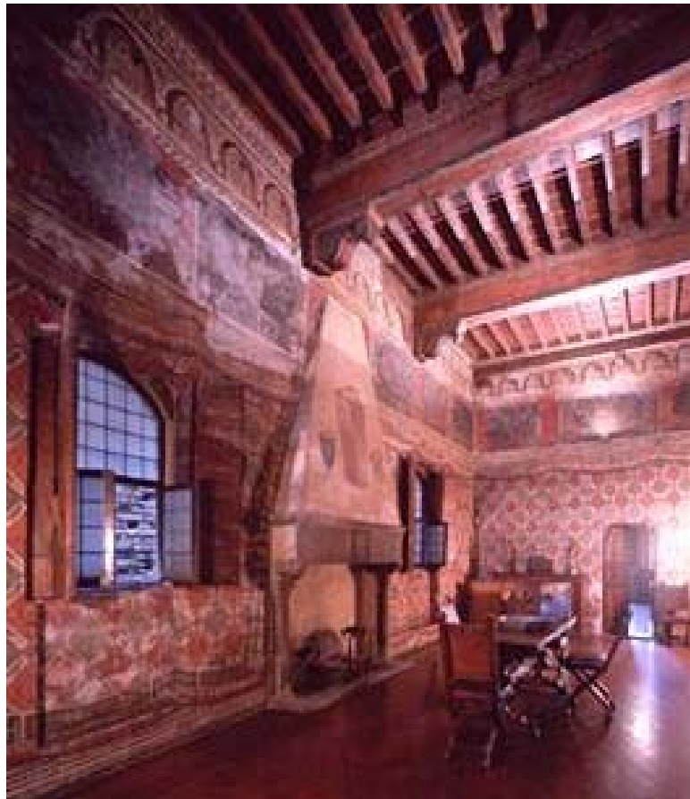
Picture 7. Palazzo Davanzati

The high, decorated ceilings and painted walls of the 14th-century Palazzo Davanzati in Florence, Italy, were typical in the homes of wealthy people during the Renaissance.