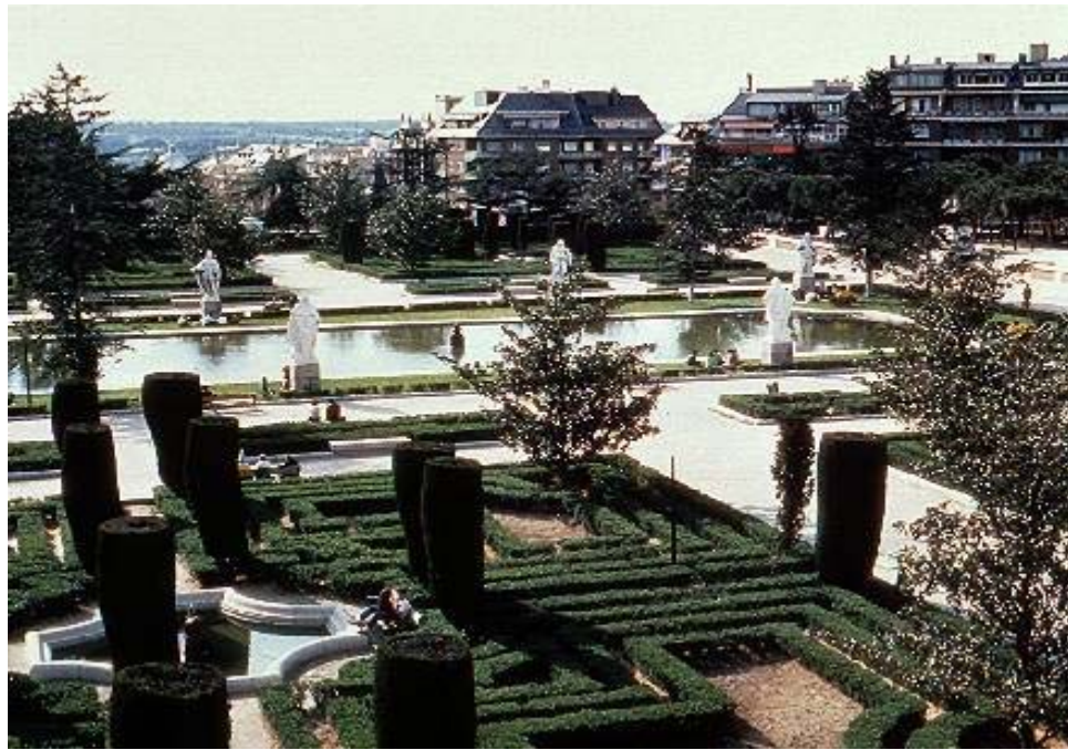
Picture 5. Sabatini Gardens, Palacio Real, Madrid, Spain

The city of Madrid, capital of Spain, is the home of many grand buildings, including the Palacio Real (Royal Palace). The Sabatini Gardens, on the grounds of the palace, are a classic example of a formal garden, or parterre , with shaped yews, shrubbery in geometric shapes, and a man-made pond with classical statuary.