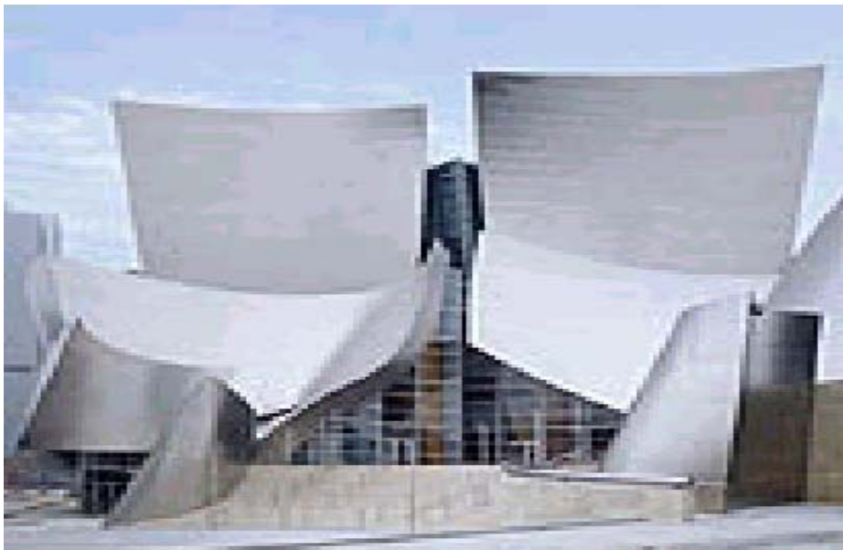
Picture 10. Frank Gehry's Walt Disney Concert Hall

The stainless steel curves of the Walt Disney Concert Hall shine in the Southern California sun.