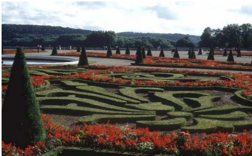
Picture 6. Gardens at Versailles

The city of Madrid, capital of Spain, is the home of many grand buildings, including the Palacio Real (Royal Palace). The Sabatini Gardens, on the grounds of the palace, are a classic example of a formal garden, or parterre , with shaped yews, shrubbery in geometric shapes, and a man-made pond with classical statuary.