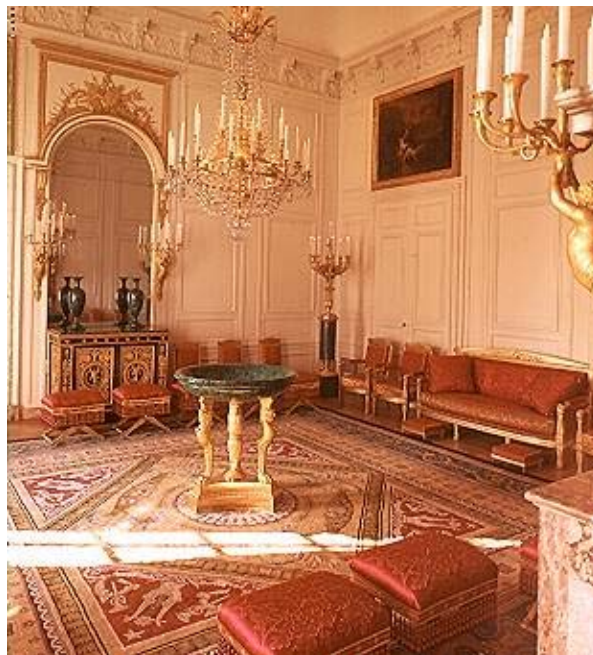
Picture 2. Reception Room, Versailles

The Red Drawing Room is part of Syon House (Middlesex, England), designed and built by Scottish-born architect Robert Adam from 1762 to 1769. Classical Roman interiors were an influence on Adam's work, but he also used ideas from his French contemporaries, who he felt understood how interior space and daily life were interconnected.