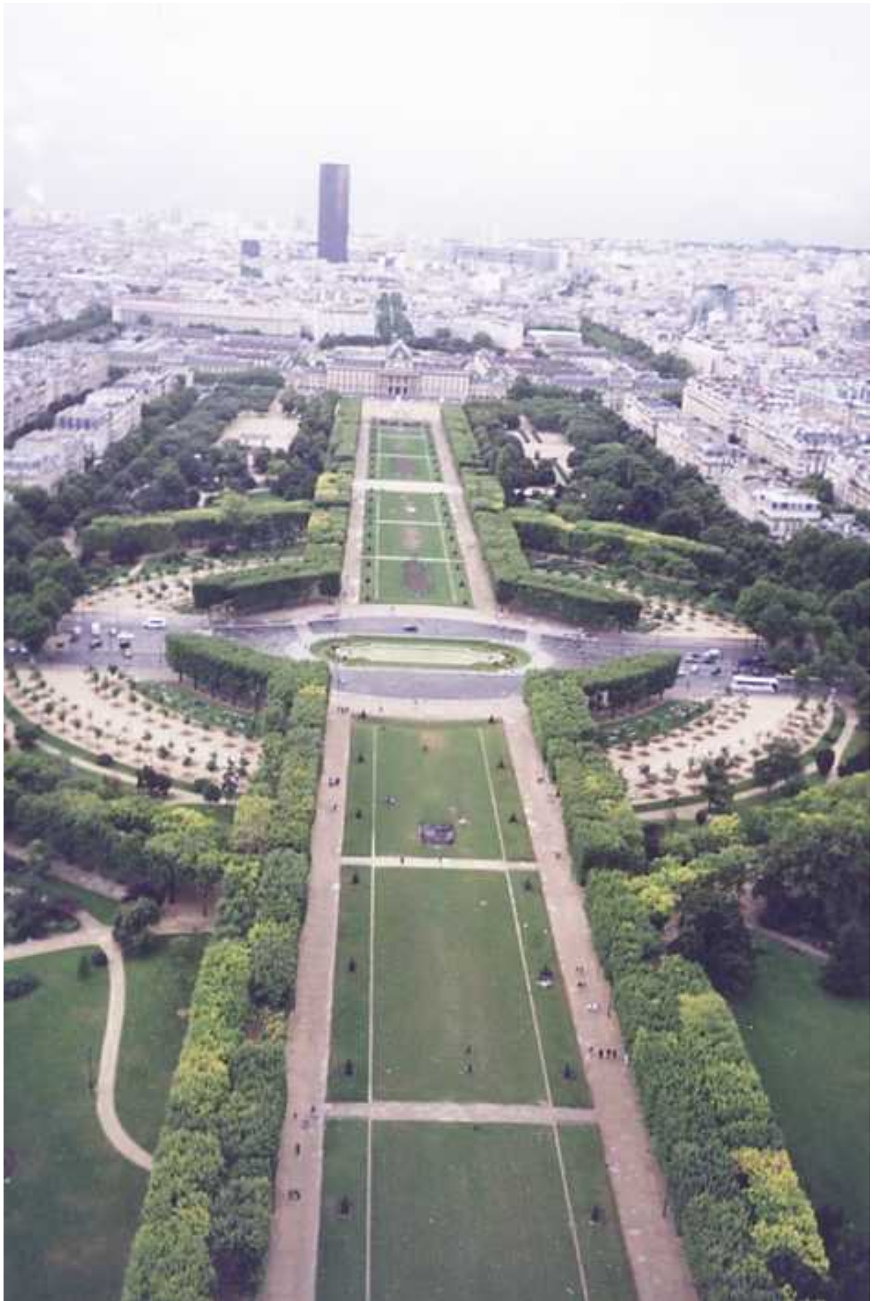
Picture 11. Paris. View from the Eiffel Tower