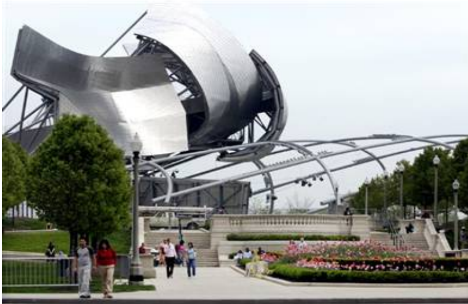
Picture 9. Frank Gehry's Park in Chicago

Millennium Park with a fountain and elaborate gardens was opened in 2004.