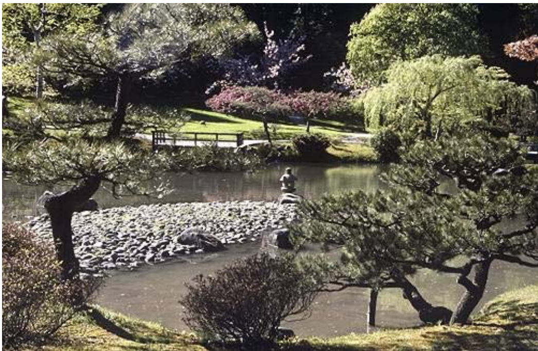
Picture 4. Japanese Garden

The villa of Hadrian, at Tivoli, Italy (ad 118/34), was the largest Roman villa ever built. This view shows one end of the Canopus, named after the two-mile canal connecting Canopus and Alexandria in Greece. The Canopus consists of a series of pillars and arches interspersed with copies of Greek sculptures surrounding an elongated pool.